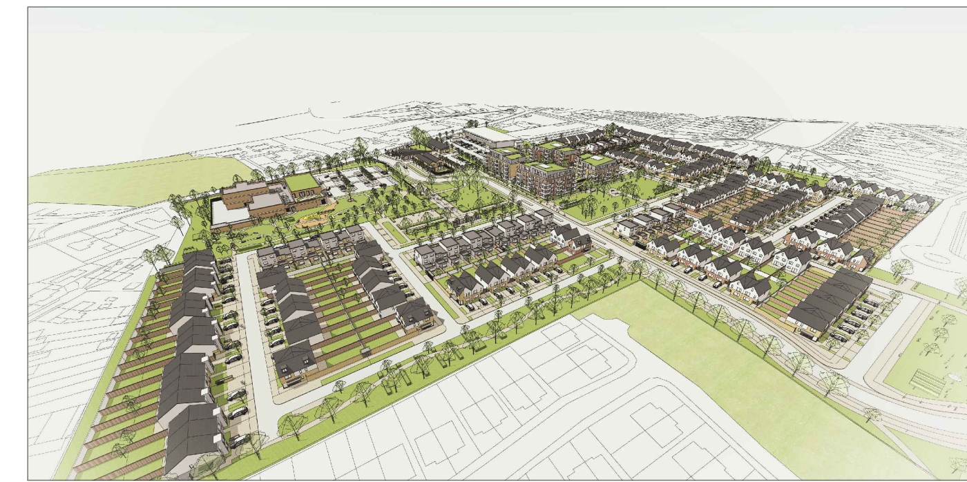
PROPOSED VIEW 2 - SHOWING INDICATIVE LOCATION OF ADJACENT SITES.