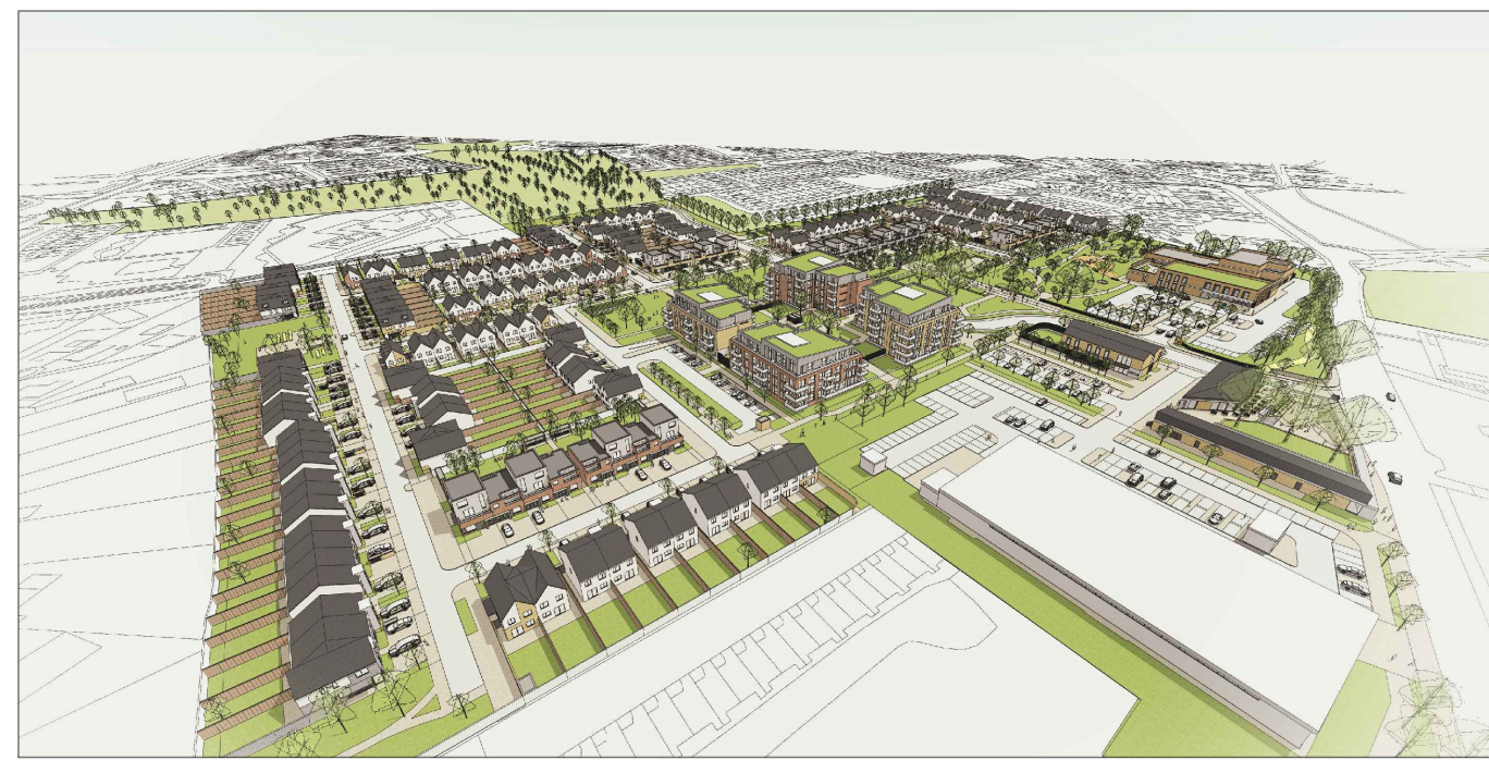
PROPOSED VIEW 1 - SHOWING INDICATIVE LOCATION OF ADJACENT SITES.