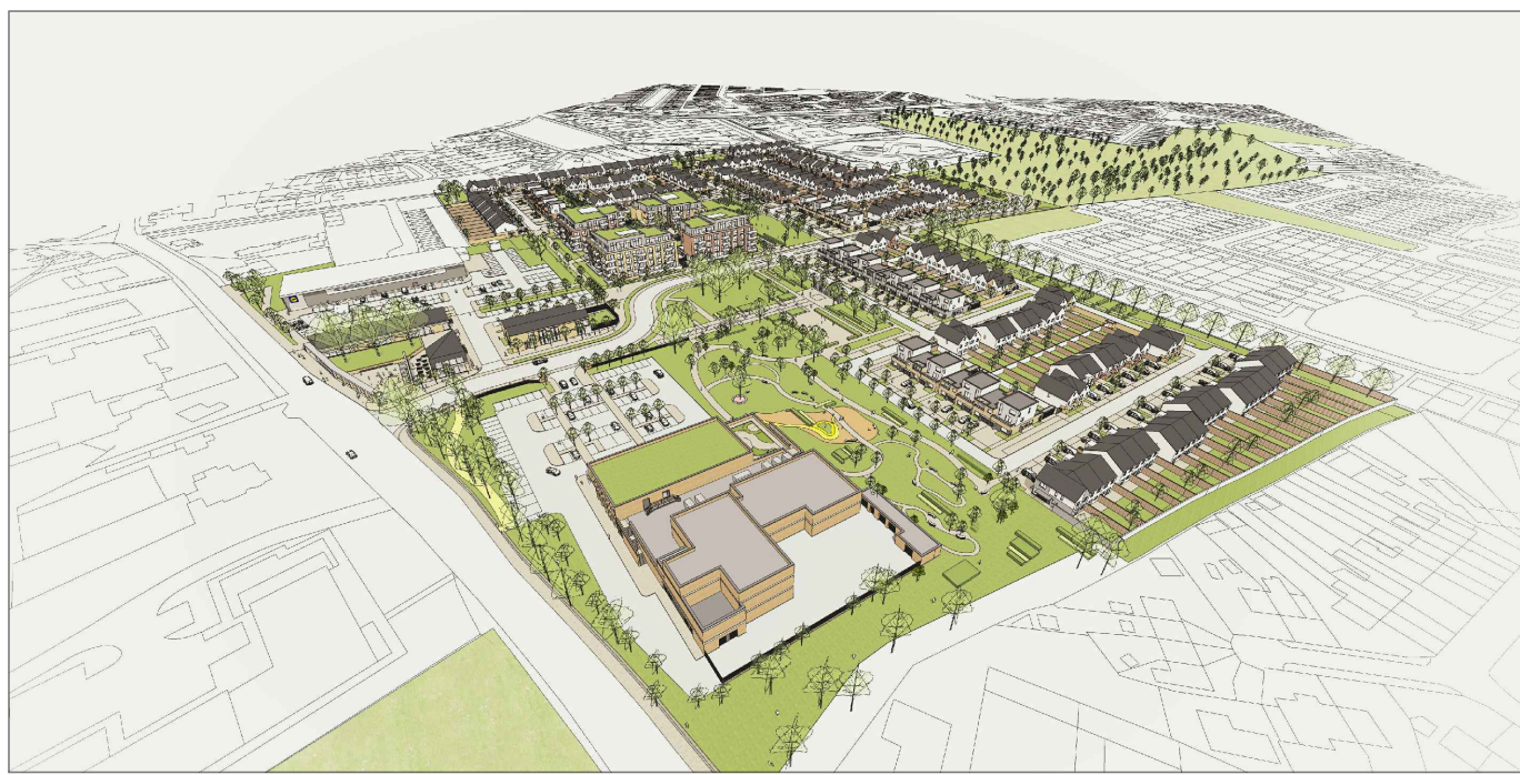
PROPOSED VIEW 3 - SHOWING INDICATIVE LOCATION OF ADJACENT SITES.